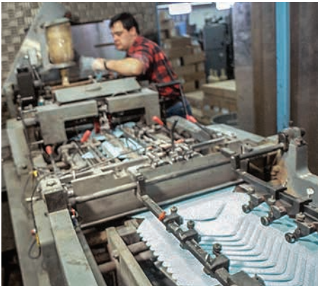
(Left) This envelope converter at an envelope plant uses vacuum from the centralized RSVS system for spacing, folding & delivering.