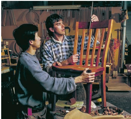
(Right) Furniture manufacturers use vacuum in place of traditional clamping methods to avoid damage.