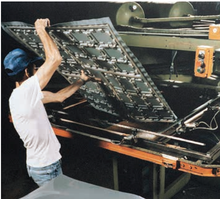
(Left) A machine operator at a plastics manufacturer removes a thermoformed shipping container for automobile headlights from a rotary vacuum press.