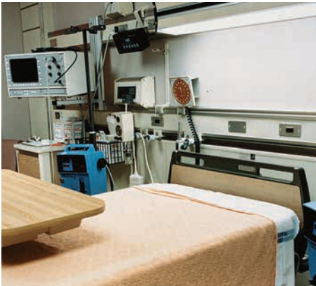
(Left) A room in the Intensive Care Unit at a Hospital, where vacuum is used for patient care.