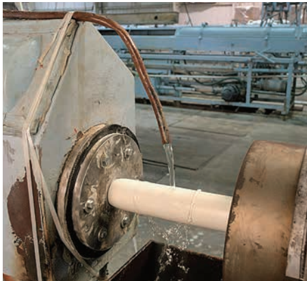
(Right) A plastics manufacturer uses vacuum during the extrusion process to rid PVS pipe of process contaminants.